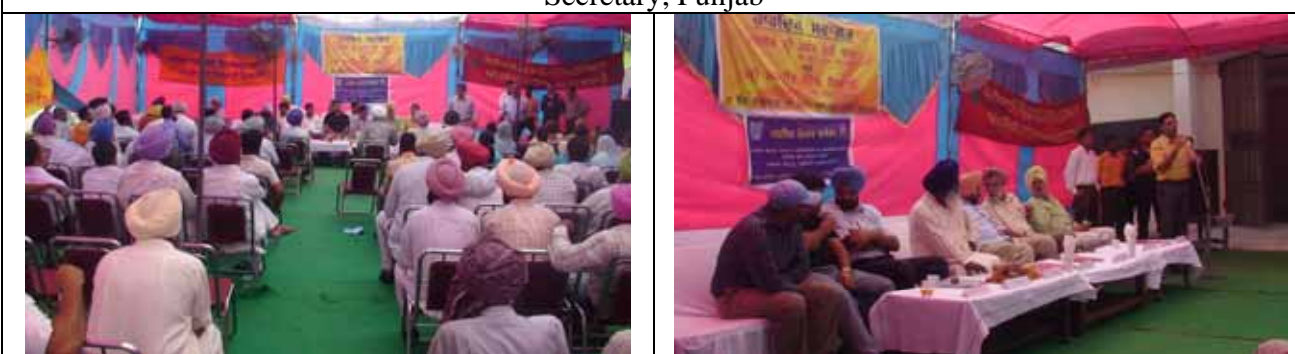
Entrepreneurship development cum awareness programme by CIPHET at village Barnhara near Ludhiana