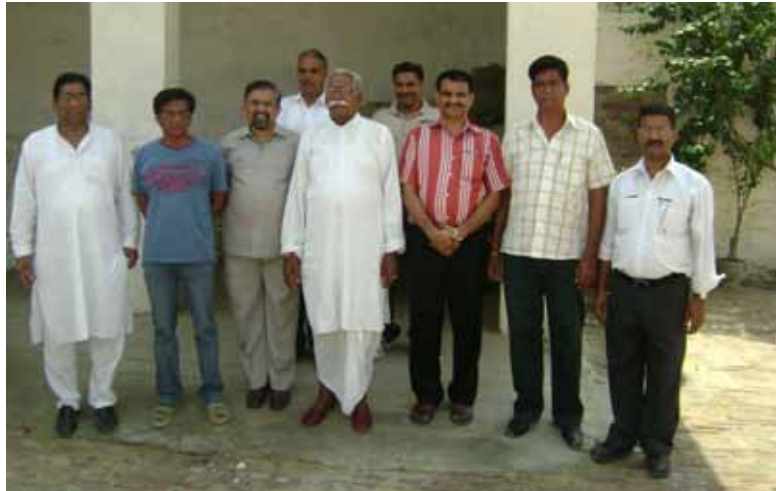
Progressive farmers of Ramsara village with Director CIPHET