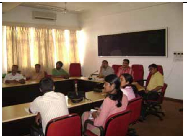
Presentations by ARS Probationers at CIPHET Abohar on Sept. 15, 2008