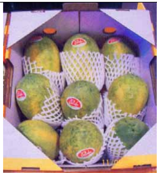
Papaya packaging in CFB for Export