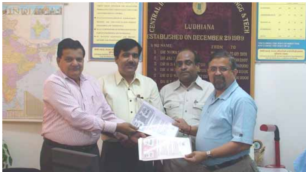
The technology for construction of Evaporative Cooled room was licensed to M/S. M.P. Warehousing and Logistics Corporation, Government of Madhya Pradesh on 18-09-2008.