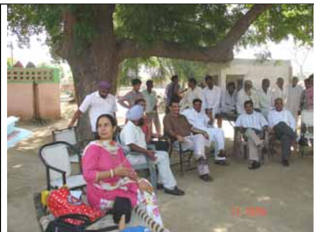
ARS Probationers and others are at village seminar including NAARM faculty