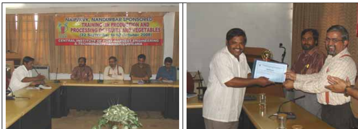
Valedictory function of NAIP/KVK sponsored training on Oct 2, 2008