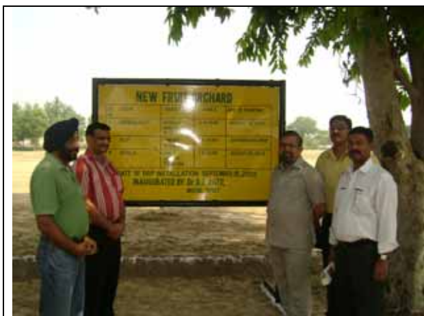
Director and Scientists looking to New Orchards