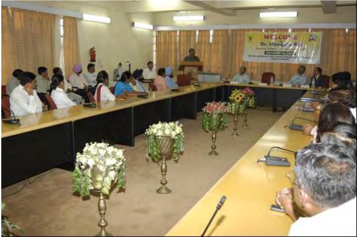
Hon. Secretary DARE & DG (ICAR) addressing CIPHET staff