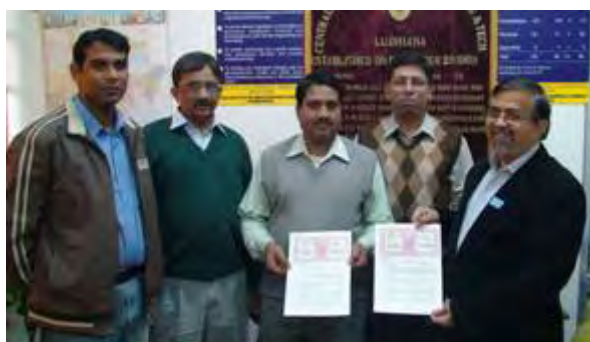
Technology transferred to M/s Krishna Oil and Dhal Mill, Dausa, Rajsthan