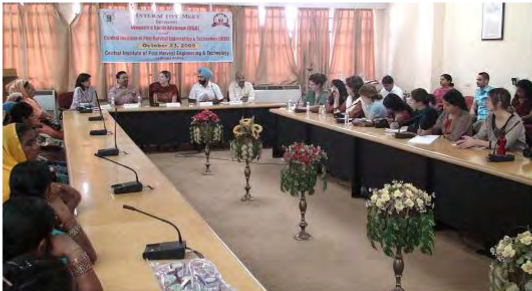
Women's Earth Alliance (WEA), USA and Local women entrepreneurs Punjab exchanging information and knowledge