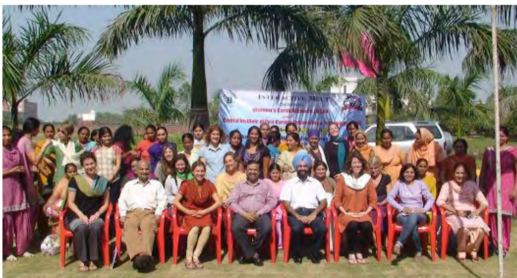
Delegates of US based Women's Earth Alliance (WEA) and Local women entrepreneurs at CIPHET Ludhiana