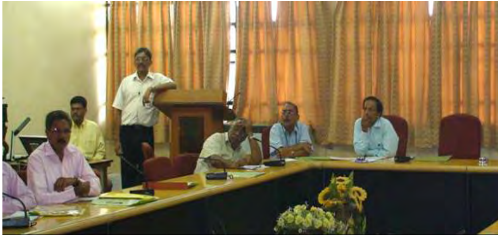
Consortium Advisory Committee (CAC) meeting of the NAIP sub projects