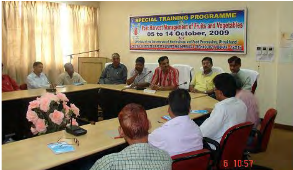
Participants of Special Training Programme on Post Harvest Management of Fruits and Vegetables at CIPHET Abohar