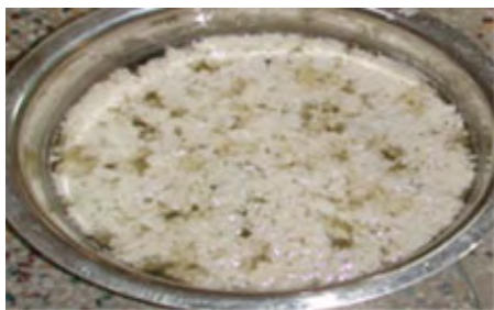
Coagulated peanut milk

Peanut paneer developed by CIPHET, Ludhiana, is tasty and very nutritious product made by coagulating hot peanut milk with food grade coagulants. It is a very versatile food and can be converted into variety of value-added products such as paneer pakoda, paneer tikki, kadhai paneer etc. Paneer can be eaten as salad item also. The paneer prepared from the whole kernel had moisture 62.1\pm 0.8\% , Protein 13.6\pm 0.5\% , Fat 19.2\pm 1.5\% , ash, 1.9\pm 0.2\% and carbohydrate 3.2\pm 0.1\% . Low fat paneer from peanut milk can also be made with high nutritional and acceptability score. The technology of making full fat and low fat peanut paneer, developed by CIPHET is ready to commercialize and has already been transferred to upcoming entrepreneurs.