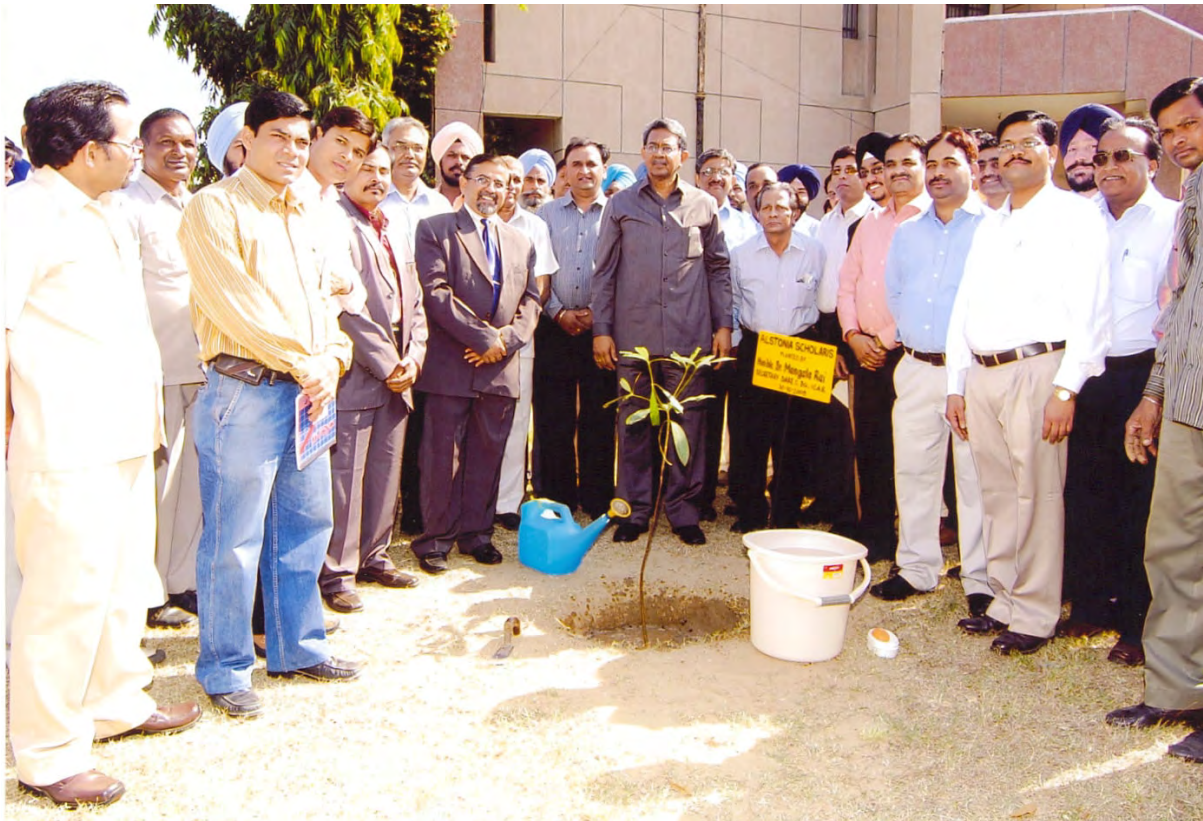
Planting of sapling in CIPHET campus by Hon. Secretary DARE & DG (ICAR)