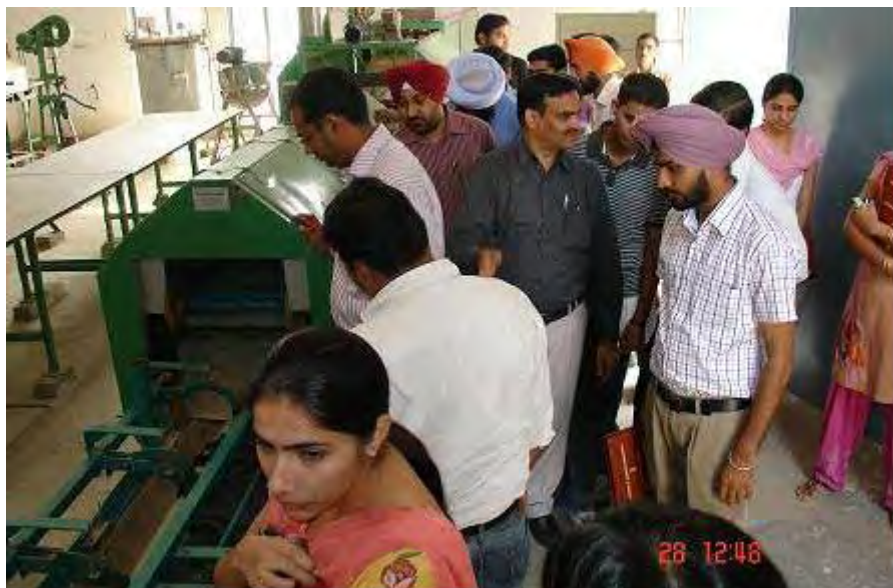
Faculty from MIMIT visiting Kinnow Waxing and Grading Plant at CIPHET, Abohar