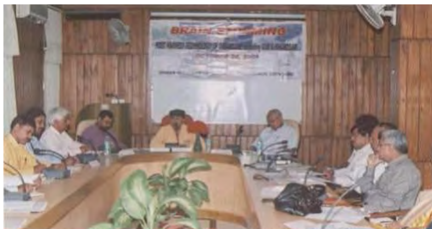
Brain Storming session on Post Harvest Technology of Sugarcane including Jaggery and Khandsari at Indian Institute of Sugarcane Research, Luknow on October 24, 2009.