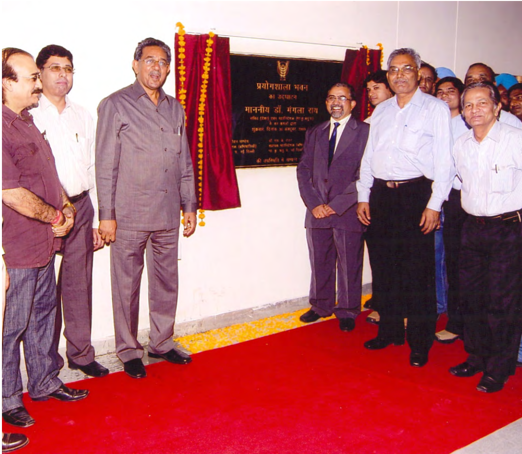
Inauguration of Laboratory Building