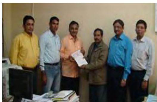
Technology transferred to M/s Geeta Industries, Junagarh, Gujrat