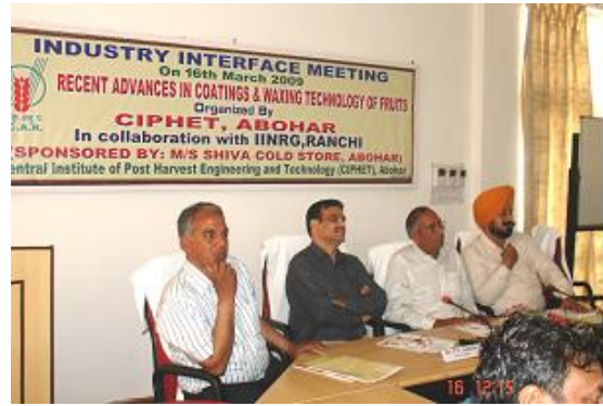
Technical session during Industry interface meeting