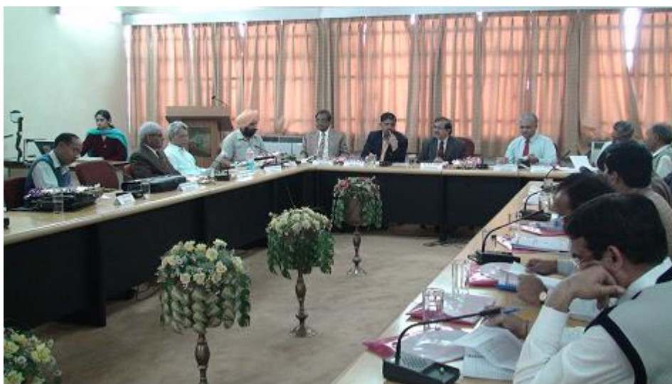
CIPHET IMC meeting in progress