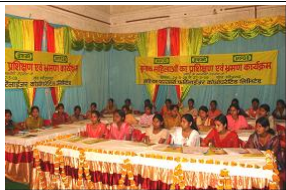
Participants of IFFCO-CIPHET Farm Women Training