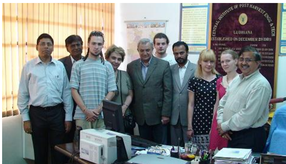
Russian delegation visiting CIPHET on March 4, 2009

A group of students of agricultural engineering discipline along with one faculty member visiting PAU Ludhiana, visited CIPHET Ludhiana on March 4, 2009. They were explained institute activities and shown the facilities of laboratories and pilot plants.