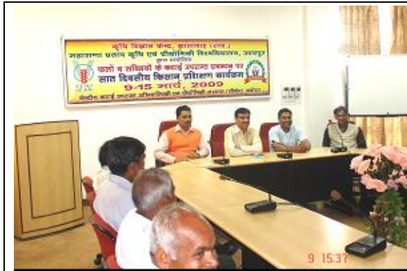
One week EDP on Post Harvest Management and Value Addition