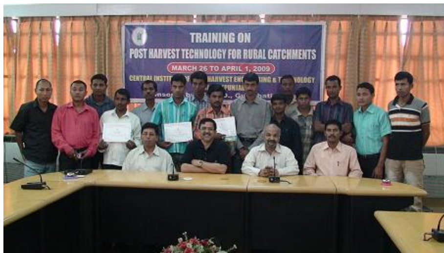
Trainees of Post Harvest Technology for Rural Catchments

chillies, fruits and vegetables, preparation of project profiles, technologies commercialized under AICRP on PHT were covered along-with practicals in institute laboratories. The visits to various laboratories, pilot plants and industry were also included in the training for benefit of the farmers.