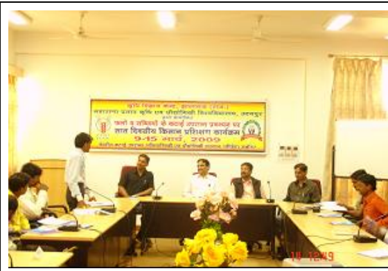
Trainees giving feedback on EDP