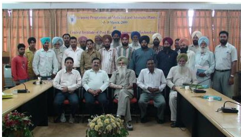
Participants of Training program on Primary Processing of Medicinal and Aromatic Plants