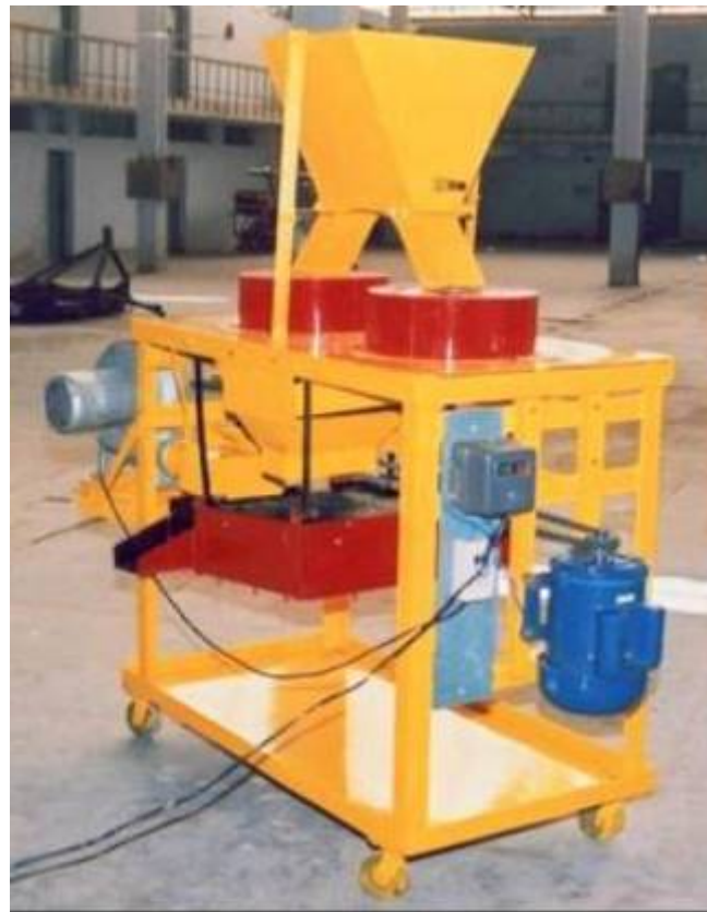
CIPHET developed castor pod decorticator

Currently castor seeds are manually depodded. After harvesting, the castor pods are sun dried for 3 – 12 days, depending on the initial moisture content and weather conditions. The husk is then removed from the seeds by beating with a mallet so as to release the seeds. The manual depodding process presently followed is tedious, highly time and labour consuming. Looking into socio economical conditions of farmers, a castor depodding and decortivating machine was developed at CIPHET which separates seeds from pods and dehulled from seeds by using principle of impact. The unit also contains a cleaning grading assembly which grades the seed in two sizes. The depodding and decortivating efficiency was found to be 98.5 % at 6.22 % (w.b.) moisture content of the pods. At the same moisture content the capacity was also as high as 179 kg/h. Overall dimension of the machine was 1255 x 625 x 1595 mm. Single person can conveniently operate the machine. The fabrication cost of the machine was Rs.25,000/- excluding cost of 2 hp electric motor. The operating cost of the machine was Rs.0.65 per quintal of castor pods for 8 h per day operation.