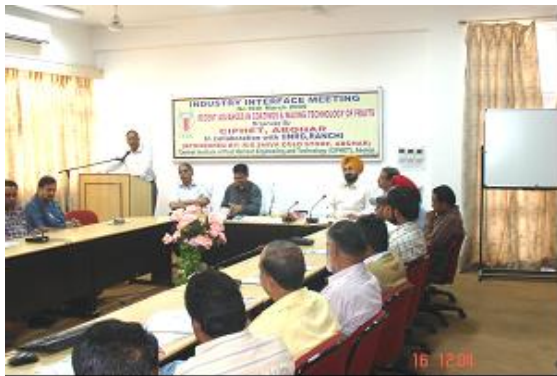
Industry Interface Meeting at CIPHET Abohar