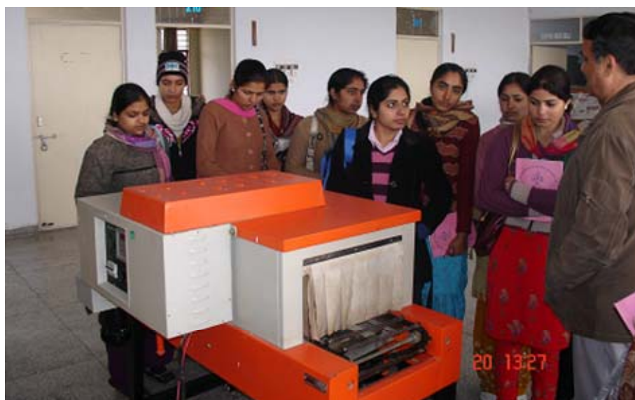
Shrink wrapping Machine is explained to the trainees