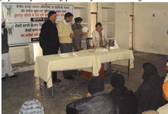
Demonstration of Groundnut milk preparation and its value added products to jail inmates