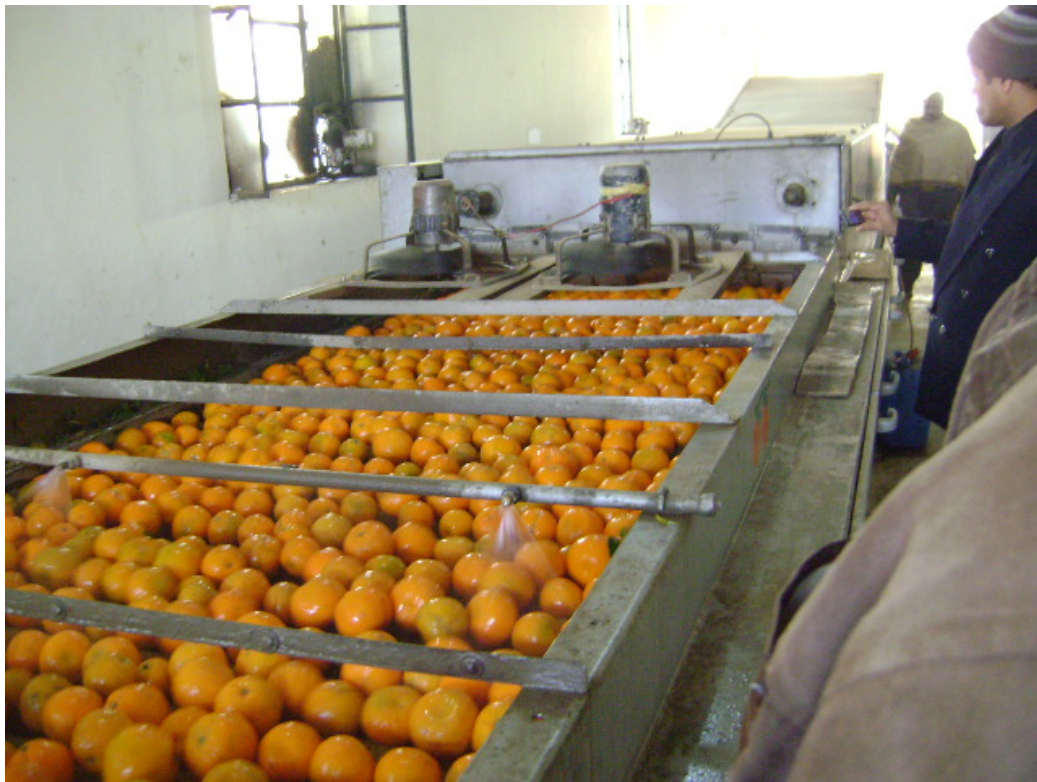
NABARD Officers visiting operation of Farmers First Agro Processing Unit at Mauzgarh

Kinnow Grading and Waxing Plants, Super Fine Agro-Industries (Guar Gum Plant), Hi Tech Nursery, Punjab Agro Juices Limited, Abohar, Zamindara Farm Solutions (P), Ltd., Fazilka and other food processing industries. Besides, exposure to relevant post harvest and processing technologies for loss reduction and value addition of horticultural commodities, machinery involved and its availability, project profile which consisting of technical and financial parameters for formulation, appraisal and monitoring of projects, parameters for selection of machinery and suppliers, product and process management, industry norms, market research and analysis for entrepreneurship development, etc. was also given to the officers though lectures and other field visits as a part of their capacity building programme in the area of post harvest management of Horticulture and Plantation Crops.