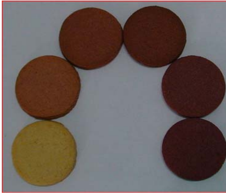
Dried beetroot supplemented (0 to 10%) defatted soy fortified biscuits