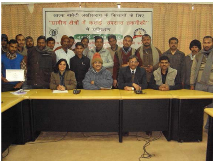
Participants from ATMA BAME TI Lakhisarai