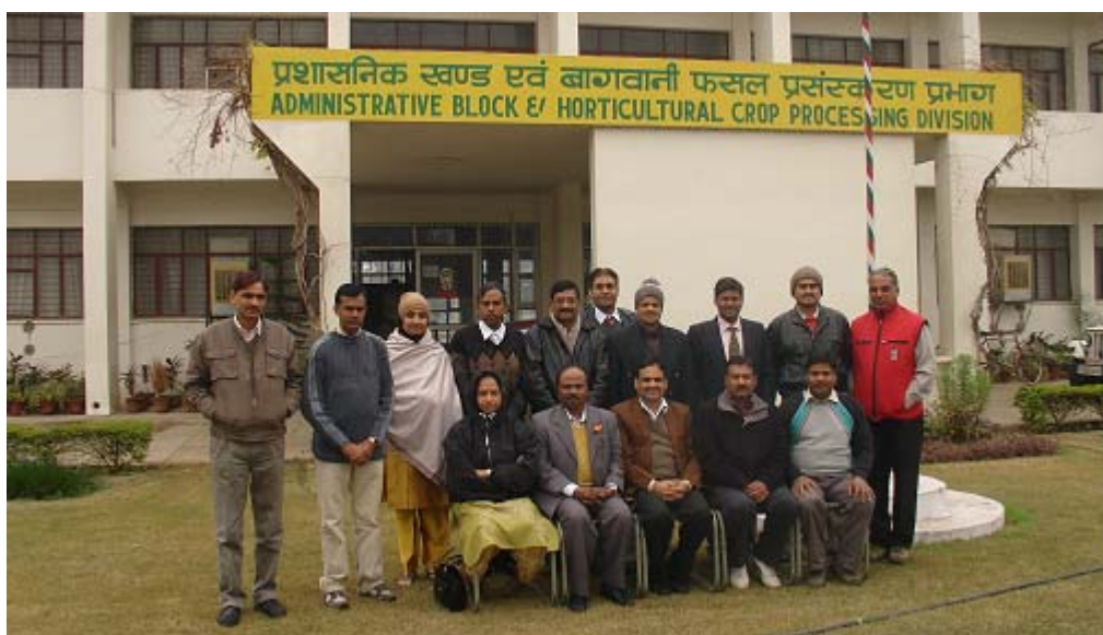
Participants with CIPHET, Abohar Faculty