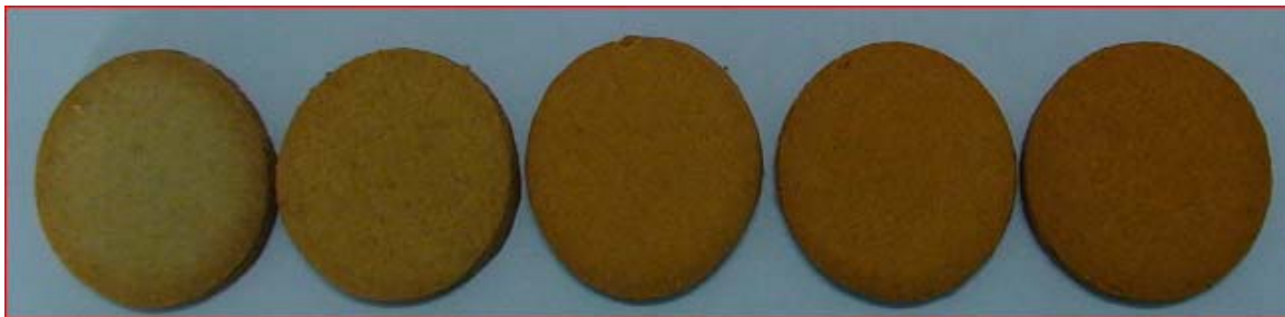
Dried carrot supplemented (0 to 10%) defatted soy fortified biscuits

© CIPHET reserves all rights to information contained in this publication, which cannot be copied or reprinted by any means without express permission.