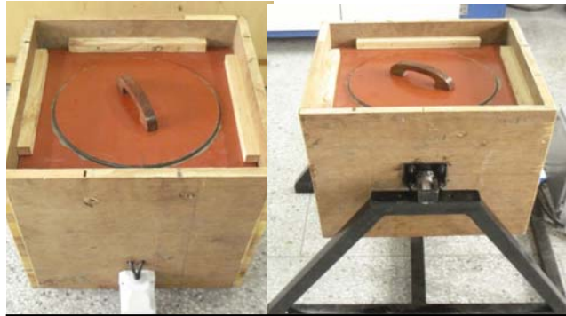
Ohmic heating system enclosed in wooden frame (left) and mounted on a stand (right)

Rice bran is the outer layer of the rice kernel and a by-product of the rice milling process. Several studies have reported that rice bran is an excellent source of nutrients and bioactive compounds including proteins, vitamins, dietary fibers, tocopherols, tocotrienols and \alpha -oryzanol. Raw bran is a light coloured oily, unstable meal of various particle sizes. The most important and crucial property of rice bran is the instability of its oil caused by an oil-splitting enzyme, lipase, inherently present in it. The enzyme, lipase acts as a catalyst.