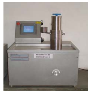
High pressure homogeniser

High Pressure Homogenizer was installed in Agriculture Structures and Environmental Control Division at CIPHET, Ludhiana at a total cost of Rs. 10 lakhs. The operating pressure is up to 40,000 psi. The minimum batch volume is 10 ml and constant flow through capacity of 44 ml/min. The applications include cell disruption, nanoemulsions and homogenization.