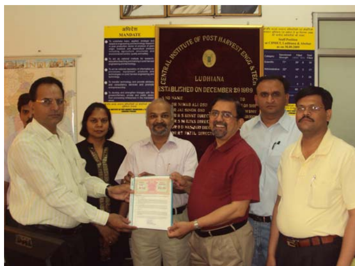
The MoU between CIPHET and entrepreneurs for licensing of green chilli processing technology

Notably, maturation stage of chilli into green colour is one month less as compared to chilli turning into red colour. As the production of powder/puree from green chilli is now possible with technological intervention of CIPHET, farmers would not require keeping their fields occupied for one month more