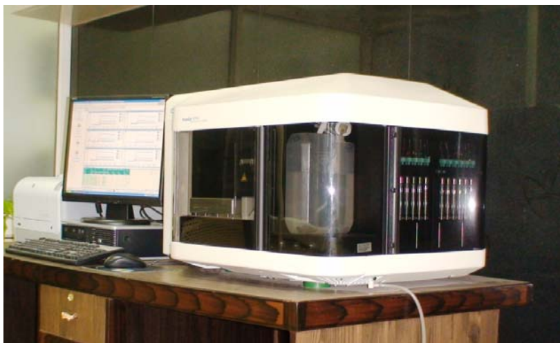
Surface Plasmon Resonance (SPR) Unit

The SPR methods also can be used to bio-molecular interaction analysis such as protein-protein, protein-DNA, DNA hybridization, kinetics and thermodynamics of