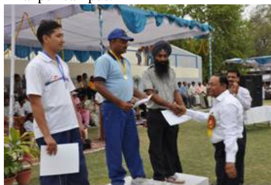
CIPHET employees receiving the honors during the ICAR sports meet held at Kanpur