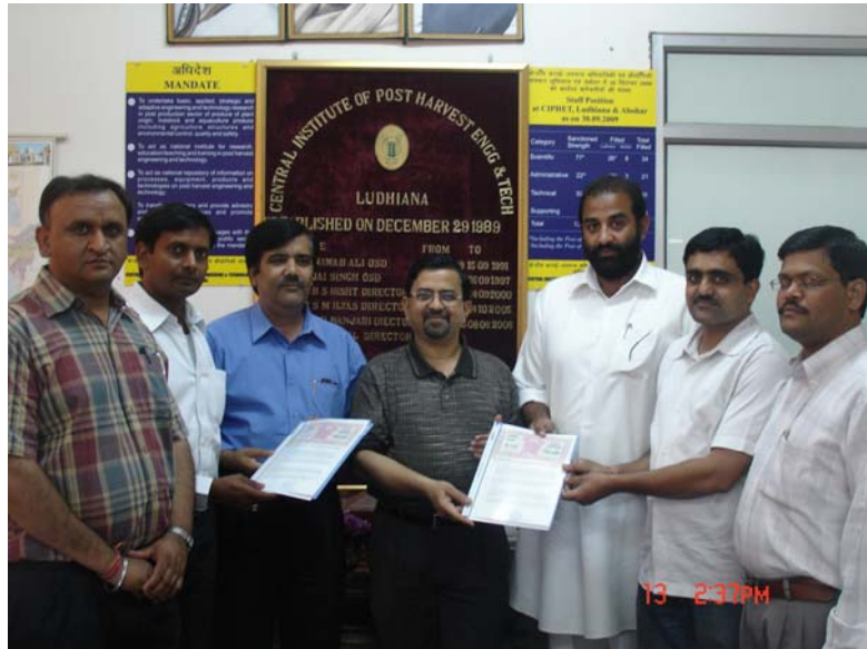
The MoU between CIPHET and entrepreneurs for licensing of meat processing technology