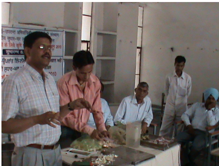
Training-cum-live-demonstration of powdering technologies by CIPHET scientists to Jail inmates