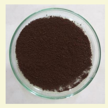
Fig: Phenol extracted from Makhana seed shells

Extraction of total phenol from makhana seed • shells: The seed shells of Euryale ferox is generally discarded after makhana popping. The shells are rich in polyphenols and are an ideal raw material for their extraction and recovery. Phenolic compounds were extracted from roasted makhana seed shells. Roasted makhana seed shells were powdered and then sieved through a mesh size of 250 microns. The seed shell powder was extracted thrice in 80 percent aqueous methanol under shaking for 30 minutes at 30°C. The extract was centrifuged at 2500 rpm for 15 minutes and the filtrate concentrated using rotary vacuum evaporator. The concentrate is then freeze dried to yield is a brown colour extract, about 4g/100g of seed shell.