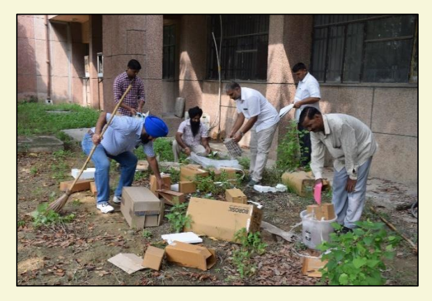
Cleaning in office side of campus, ICAR- CIPHET Ludhiana