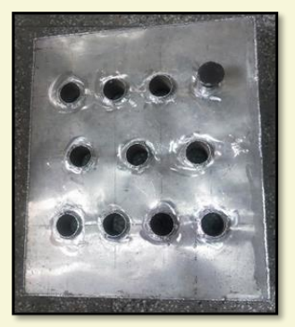
Fig 2. PCM chamber for thermal storage

A thermal storage (Phase change material, PCM chamber) chamber has been fabricated for storage of thermal energy for smart solar dryer. The dimension of PCM chamber is (70x58x6) cm with 9 holes having diameter of 5.5 cm for the hot air to pass and recharge the PCM (Fig 2). It has inlet and outlet for PCM. The PCM used is the paraffin wax having melting point of 55-58°C.