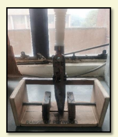
Fig 1. Hand tool mango stone decorticator

A hand tool for separation of kernel from mango stone is designed and fabricated under the project 'Production of bioactive ingredients from mango seed kernels'. It comprises of wooden mango stone holder (22 x 10) cm and a stone opener made of MS material with handles (Fig 1). The refinement of the prototype is in progress.