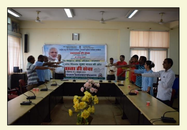
Pledge taking ceremony, ICAR-CIPHET Abohar